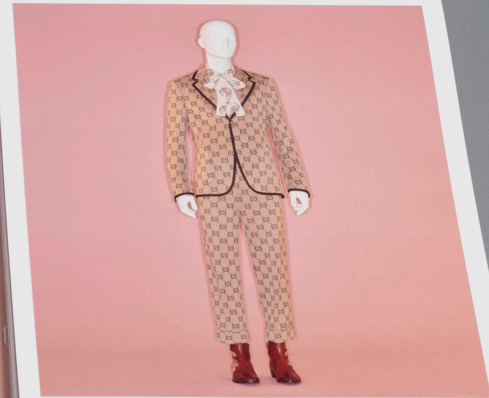
GUCCI (ITALIAN, FOUNDED 1921). ALESSANDRO MICHELE (ITALIAN, BORN 1972). ENSEMBLE, RESORT 2018

"Camp is the answer to the problem: how to be a dandy in the age of mass culture." —Susan Sontag, 1964