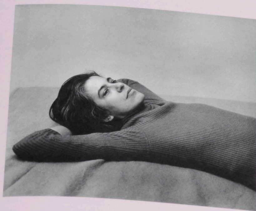
Peter Hajar (American, 1934–1987). Susan Sontag, 1975

"One should either be a work of art, or wear a work of art." —Oscar Wilde